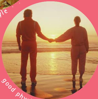
good physical health

A Chartered Physiotherapist is a university graduate with hospital-based training who has comprehensive knowledge of how the body works and specialist training in the diagnosis and treatment of injuries.